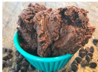
Loaded Brownie Batter