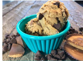
Peanut Butter & Chocolate