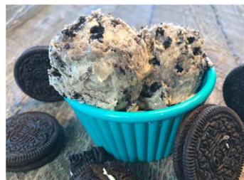
Cookies & Cream